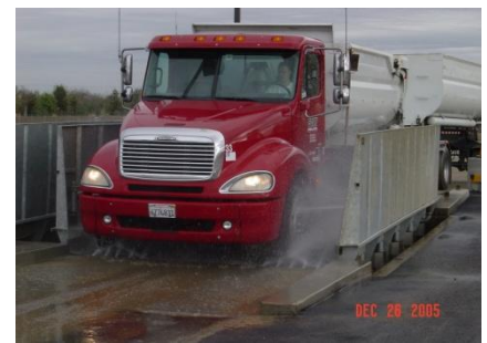
High Flow Low Pressure Effective Cleaning