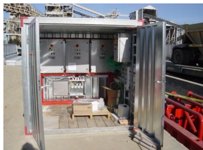
Moby Lockable Control House, Control Panels for 3 Systems, DOS Flocculent Pump